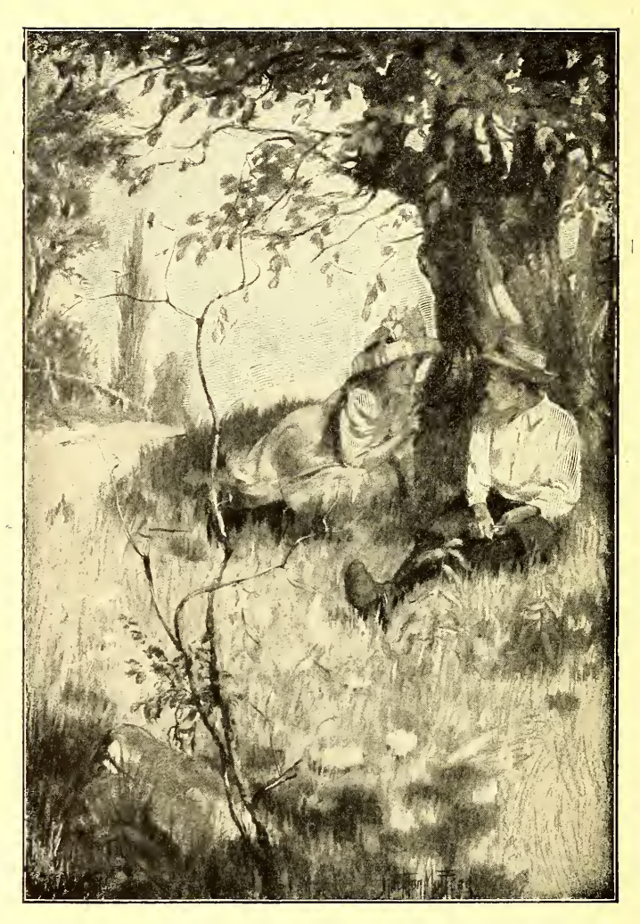
"'OH, I KNOW JUST THE PLACE FOR YOU, SHE CRIED."